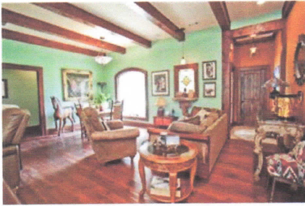
Tremendous family with exposed beams and magnificent wood floors