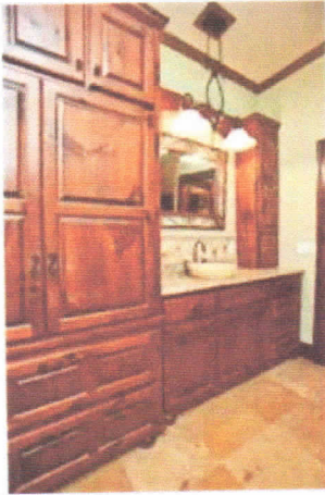
"His" side of the beautiful, hand crafted cabinetry.