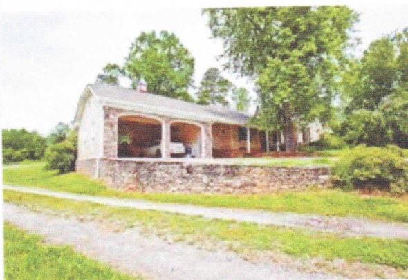
Drive to rear smaller barn