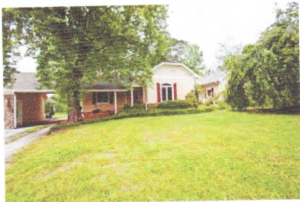
Front view of home with garage to the left.

367 Duck Thurmond Road, Dawsonville, Georgia 30534 MLS Number: 5868088