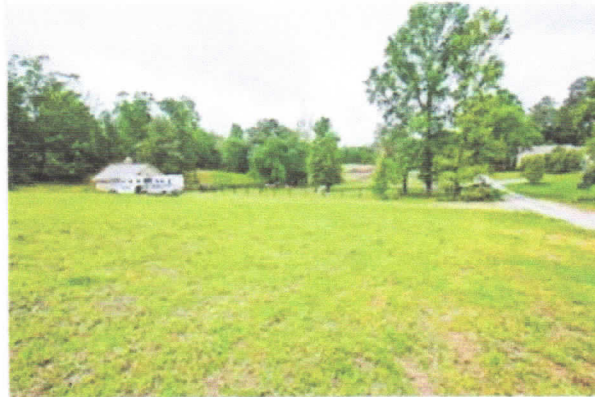
Pasture and other barn/storage area