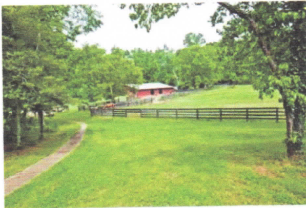
Barn and pasture