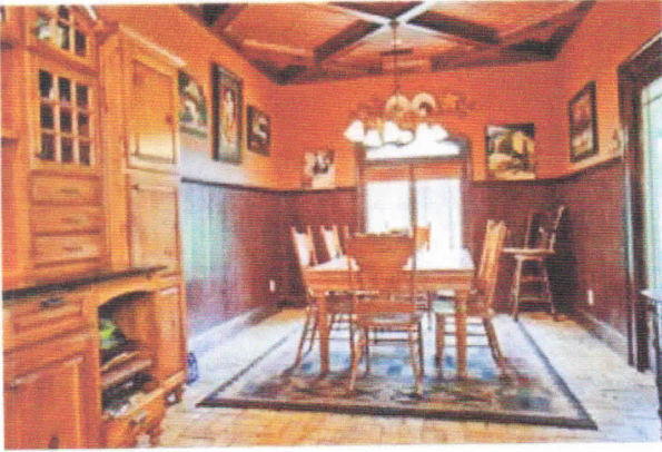
Spacious dining room with room for any sized table