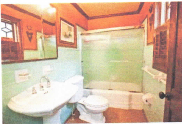
Second master suite bath room