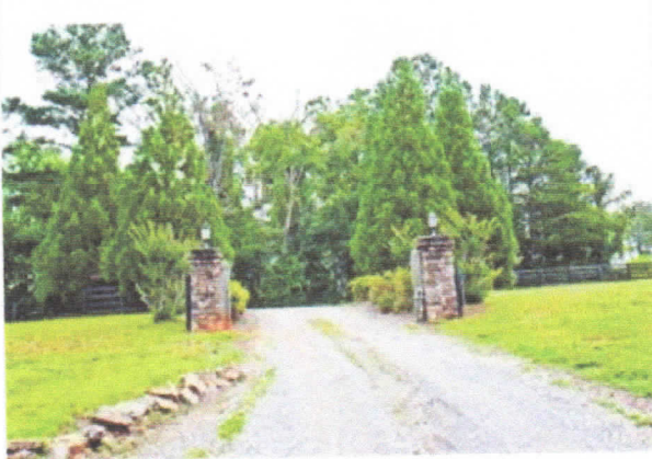
The grand entry point to the property