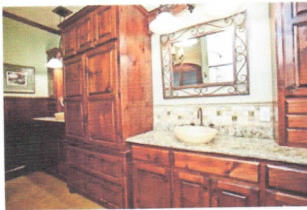
View of both sinks and cabinet