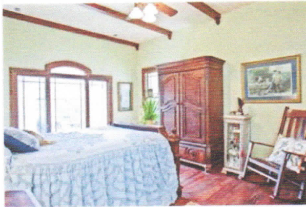
Secondary view of master suite