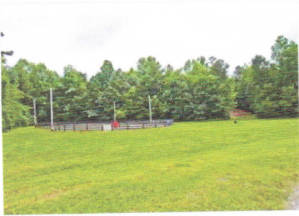
Horse riding rink and pasture