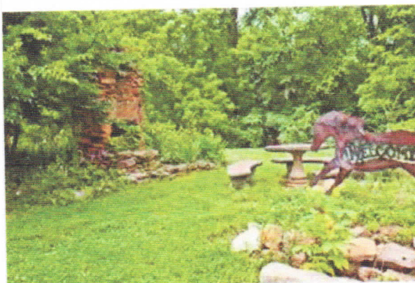
Backyard garden area to the right with old stacked stone fire place