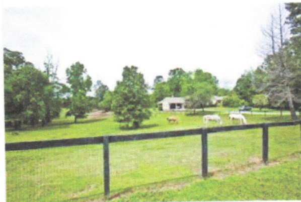
One of the fenced pastures