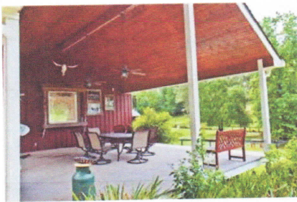
Patio on back side of garage. Large area for entertaining