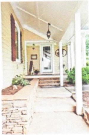
Another view of breezeway