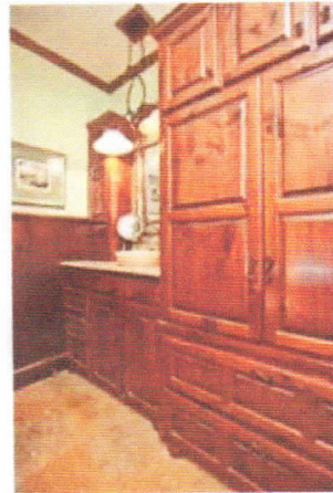
"Her's sink" flanked by custom cabinetry