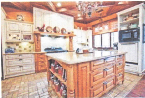
Large open kitchen with room for your "canned goods!"