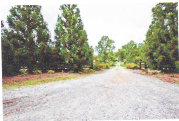
Long drive onto property