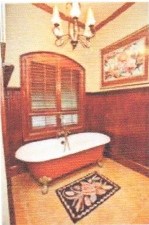
"Claw tub" in the master bedroom bath."