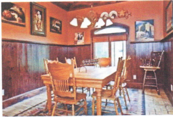
Closer look at dining area made perfect with beautiful paneling