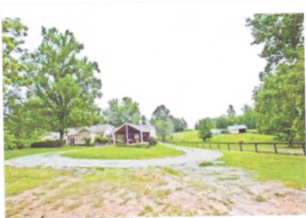
Great view of the back of the home.