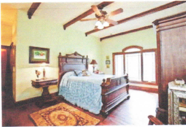
Extra large master suite