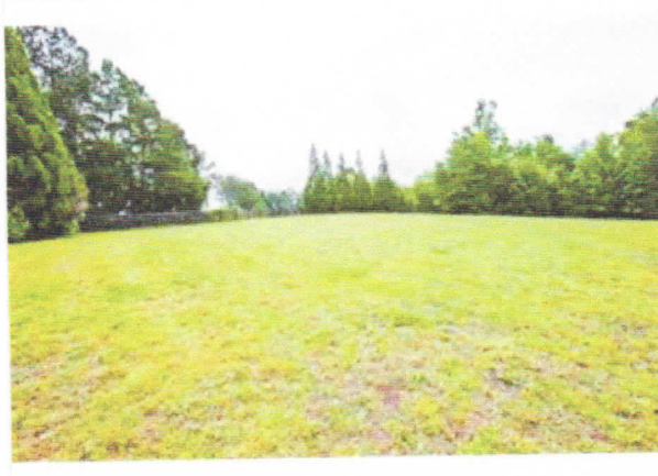
More pasture views