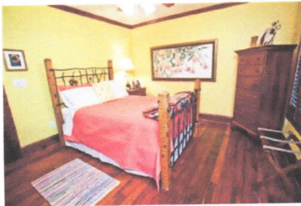
Large secondary bedroom