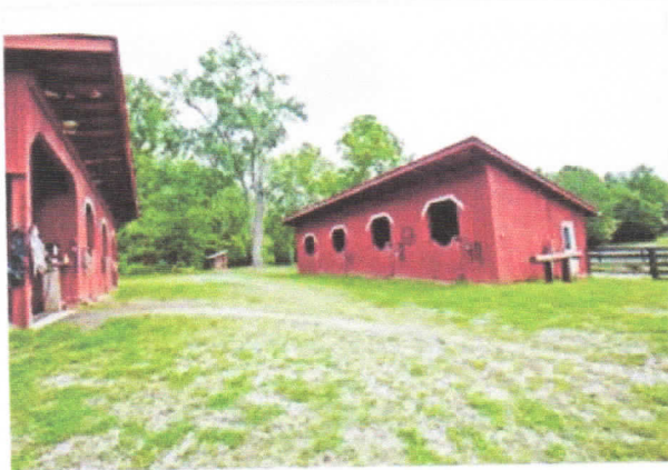
Great stables for your horses