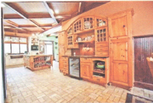
Beautiful hand build side board wall piece with room for a wine cabinet and flat ware.