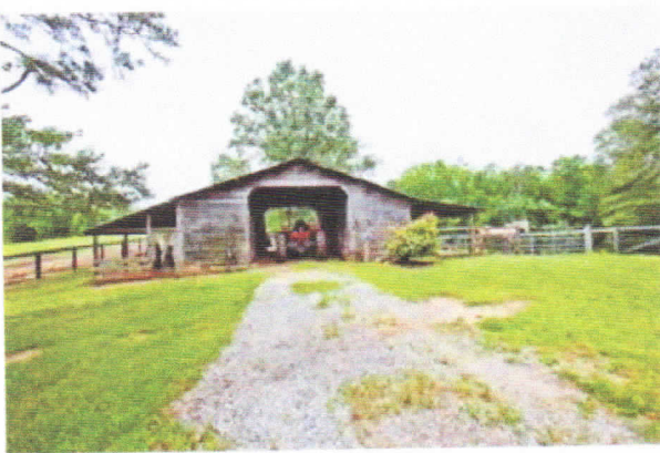
Smaller barn and storage shed with some fencing