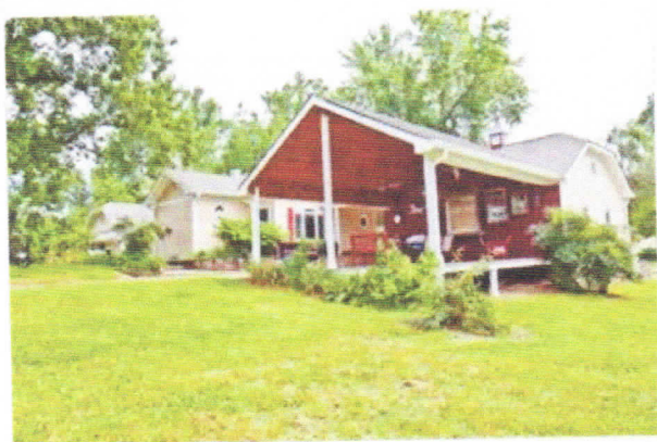
Rear of home showcasing the patio deck on the back side of the garage