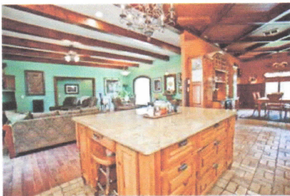
Open view from kitchen to dining room and family room. Lots of space for entertaining